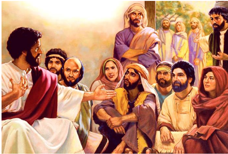
Jesus' True Family