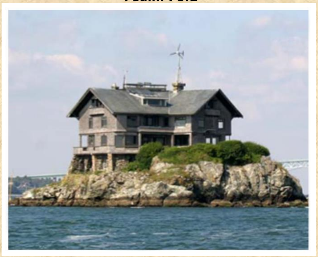
"The Wise and Foolish Builders" Luke 6:46-49

"To Him who opened His mouth in parables and uttered things hidden since the creations of the world." Psalm 78:2